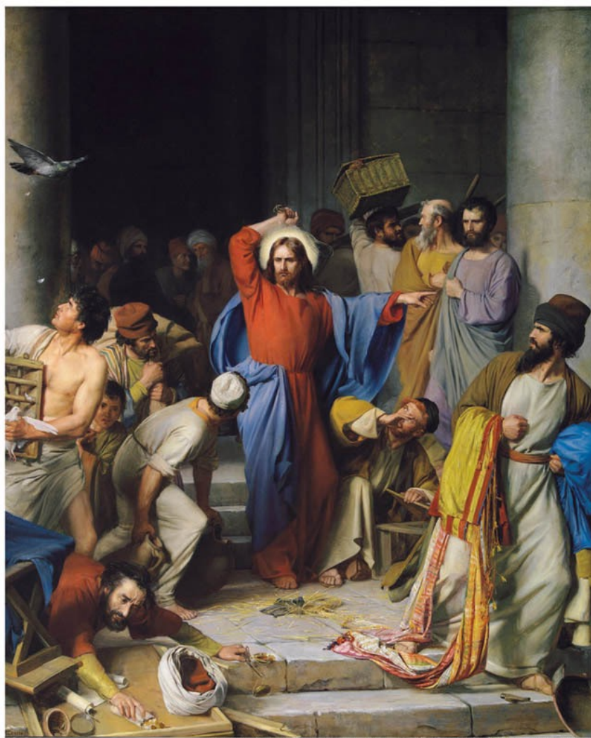
Christ Cleansing the Temple, by Carl Heinrich Bloch, used by permission of the National Historic Museum at Frederiksborg in Hillerød, Denmark.